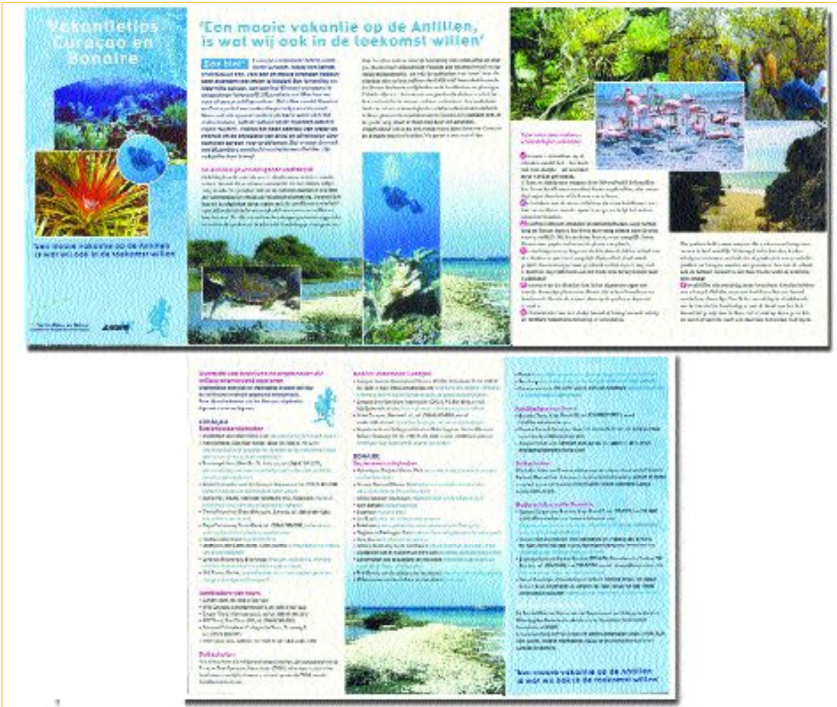
BROCHURE WITH ENVIRONMENTAL TIPS FOR VISITING THE ANTILLES

(VOMIL/MINA), co-ordinate the project activities. As the largest provider of organised holidaymakers to Bonaire and Curaçao, TUI Nederland plays an active role in the project. Apart from the active involvement of the private sector, the main financial sponsors of the project are the Netherlands Ministry of Agriculture, Nature Management and Fisheries, the Antillean Department of Environment, and the Netherlands Centre for Sustainable Development (NCDO), which have contributed a total of 52,000 Euro (US$61,457).